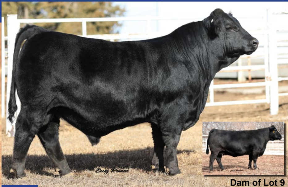
Dam of Lot 9